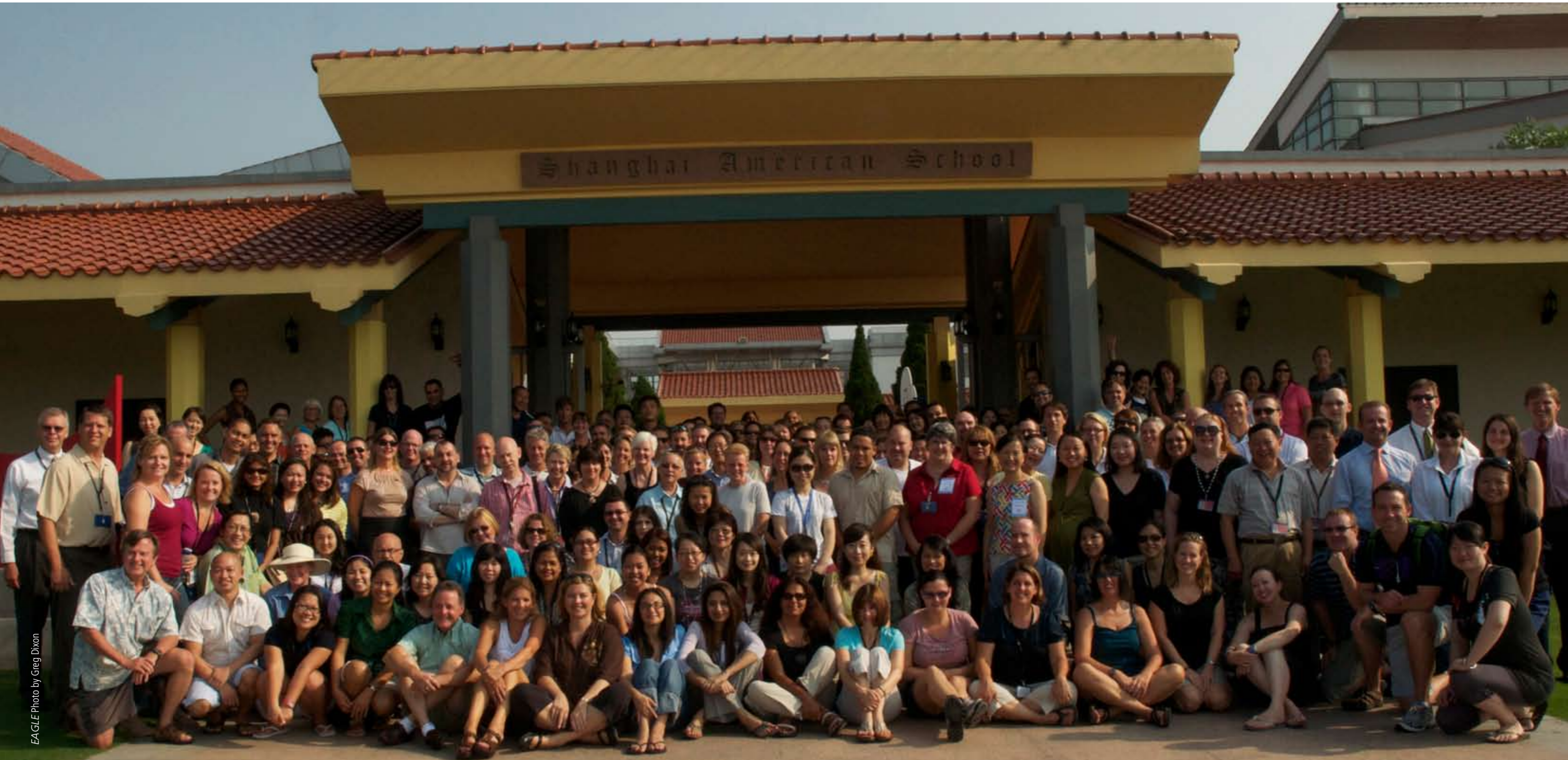
SHANGHAI AMERICAN SCHOOL, PUDONG CAMPUS FACULTY AND STAFF, 2010-2011