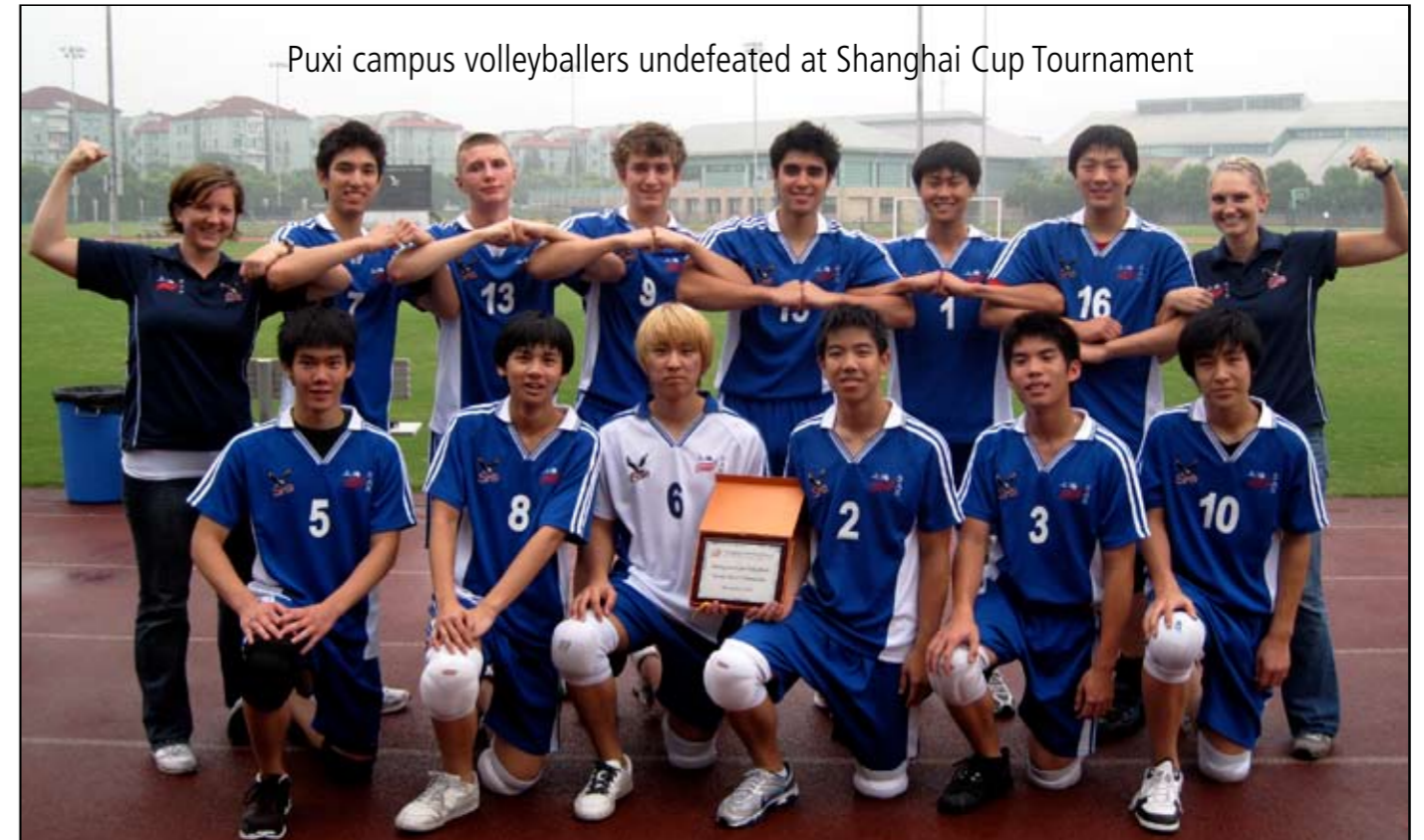
Puxi campus volleyballers undefeated at Shanghai Cup Tournament

Congratulations to the SAS Puxi Campus Boys Varsity Volleyball team who took first place in the Shanghai Cup Tournament on Saturday, September 11. The boys were undefeated in nine games against SAS Pudong Campus, Concordia International School Shanghai and Shanghai Community International School. The SAS Puxi Campus JV1 boys team also took first place in their JV division. Next, teams will travel