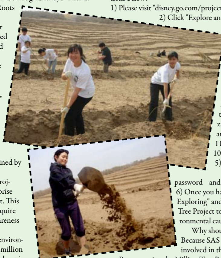
PHOTOS: SAS students plant trees in Inner Mongolia last spring. For full story of this trip, see The Eagle , May 7, 2010.

Remember that a vote can be cast in every week! Thank you!