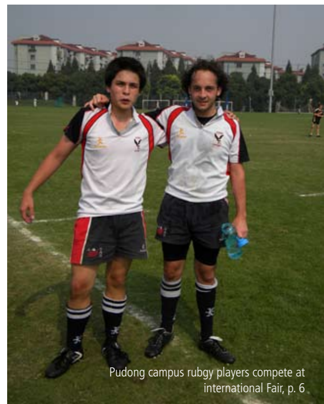
Pudong campus rugby players compete at international Fair, p. 6

October 25: CISSA City Wide Cross Meet, hosted by SAS PD @ The Shanghai Links Golf Club. First race Starts 4:30pm "Sharp" Please check out our new activities blog http://teachers.saschina.org/pdactivities/