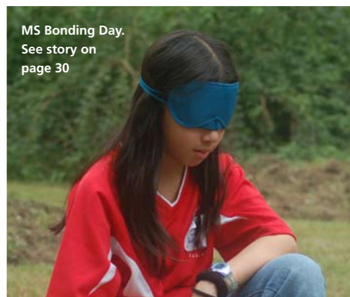
MS Bonding Day. See story on page 30