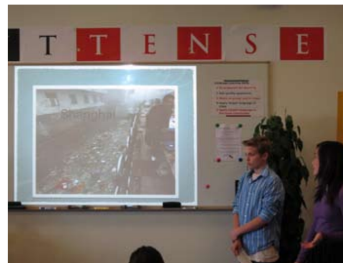
December 3, 2010

in Starbucks, various expats and even a few parents really brought an authenticity to many projects. Many of these subtitled videos revealed a high level of inquiry and genuine interest in the lives of people on the exteriors of 8th-grade reality. There was certainly a feeling that these issues did not exist very far away. The kids reached into their communities and highlighted how present much of this curriculum is.