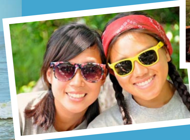
Scrapbook photos of Sri Lanka Habitat Trip