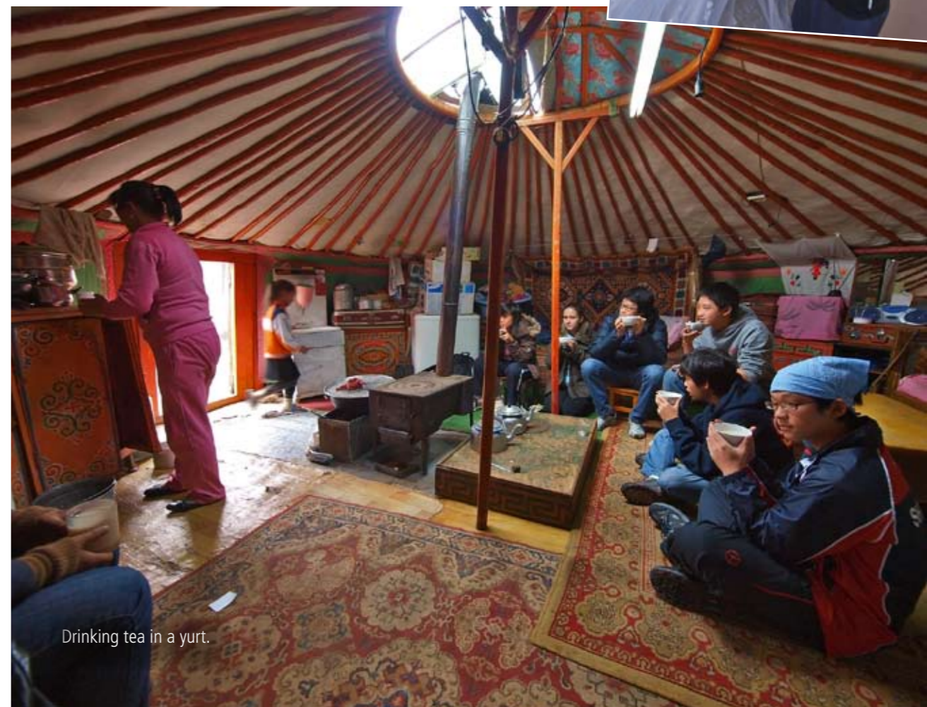
Drinking tea in a yurt.