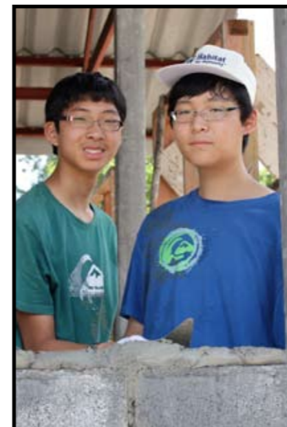
November 4, 2010