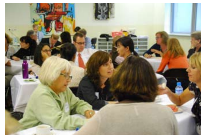
November 4, 2010

Along with the results of a supplementary online survey (to be offered to the community later in November), the Café responses will be used as data for the planning process. Here is a breakdown of the recorded World Café responses by question, arranged in thematic groupings by frequency (percentages may not add to 100% owing to rounding). For the full summary report, including representative participant responses to each question, please go to the SAS website at www.saschina.org/world-cafe .