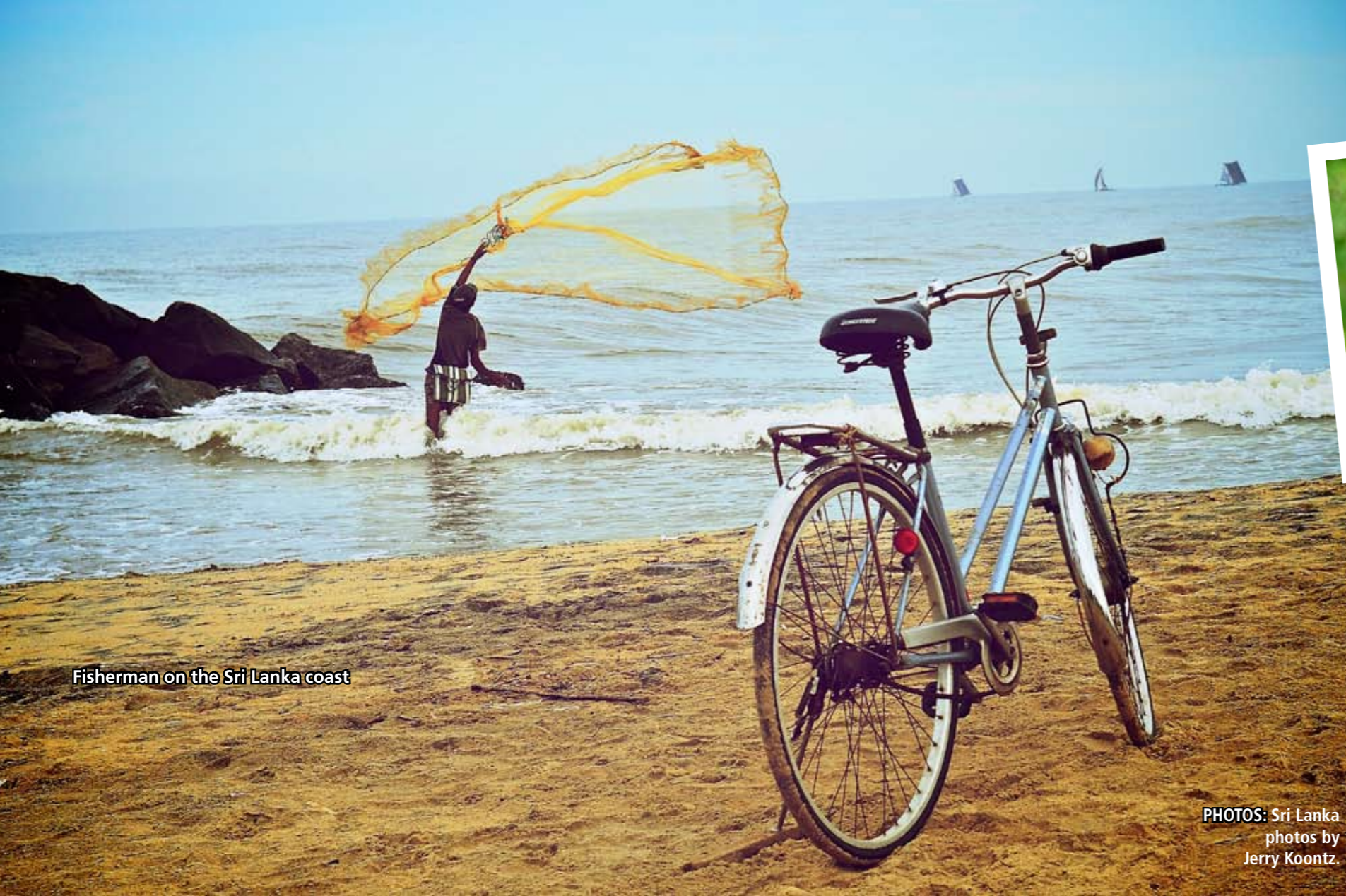
Fisherman on the Sri Lanka coast