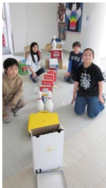
March 4, 2011

It truly was one of the most chaotic days of fifth grade ever.