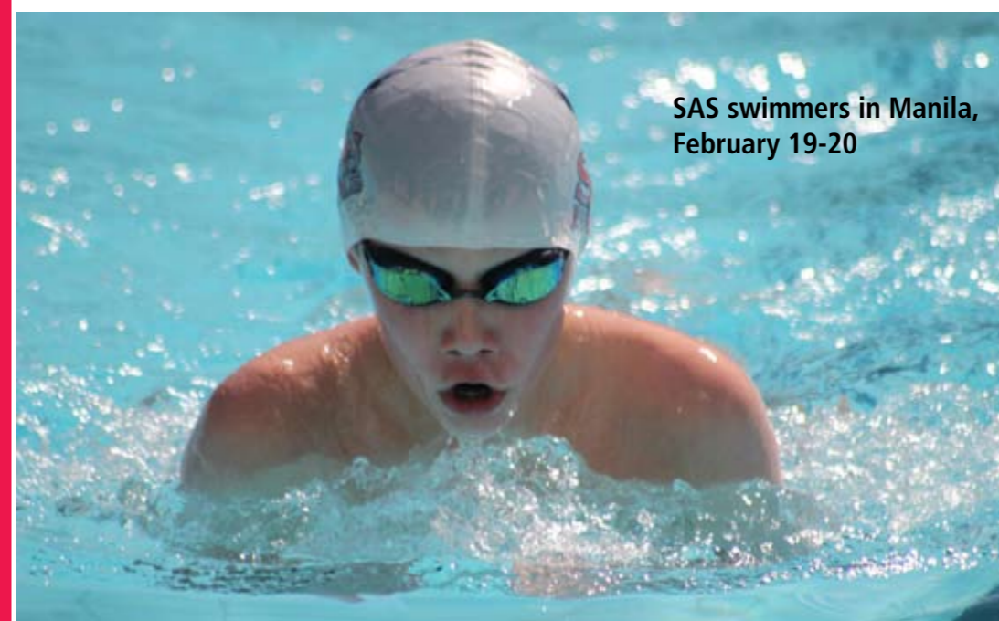
SAS swimmers in Manila, February 19-20