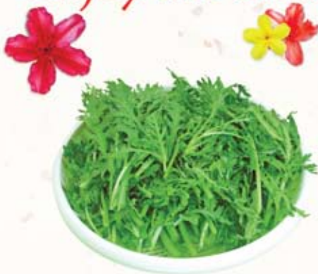
◆ Korean traditional recipes spring