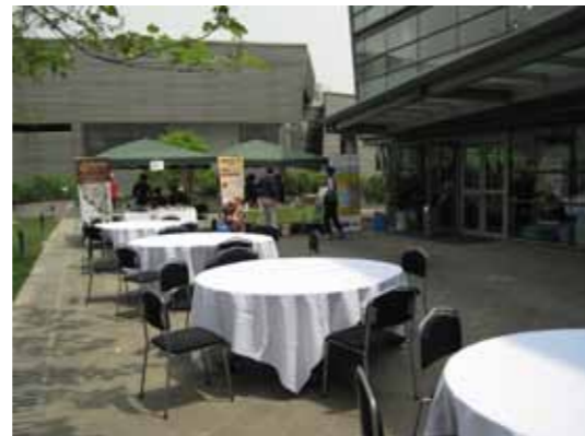
EAGLE photos by Ji Liu