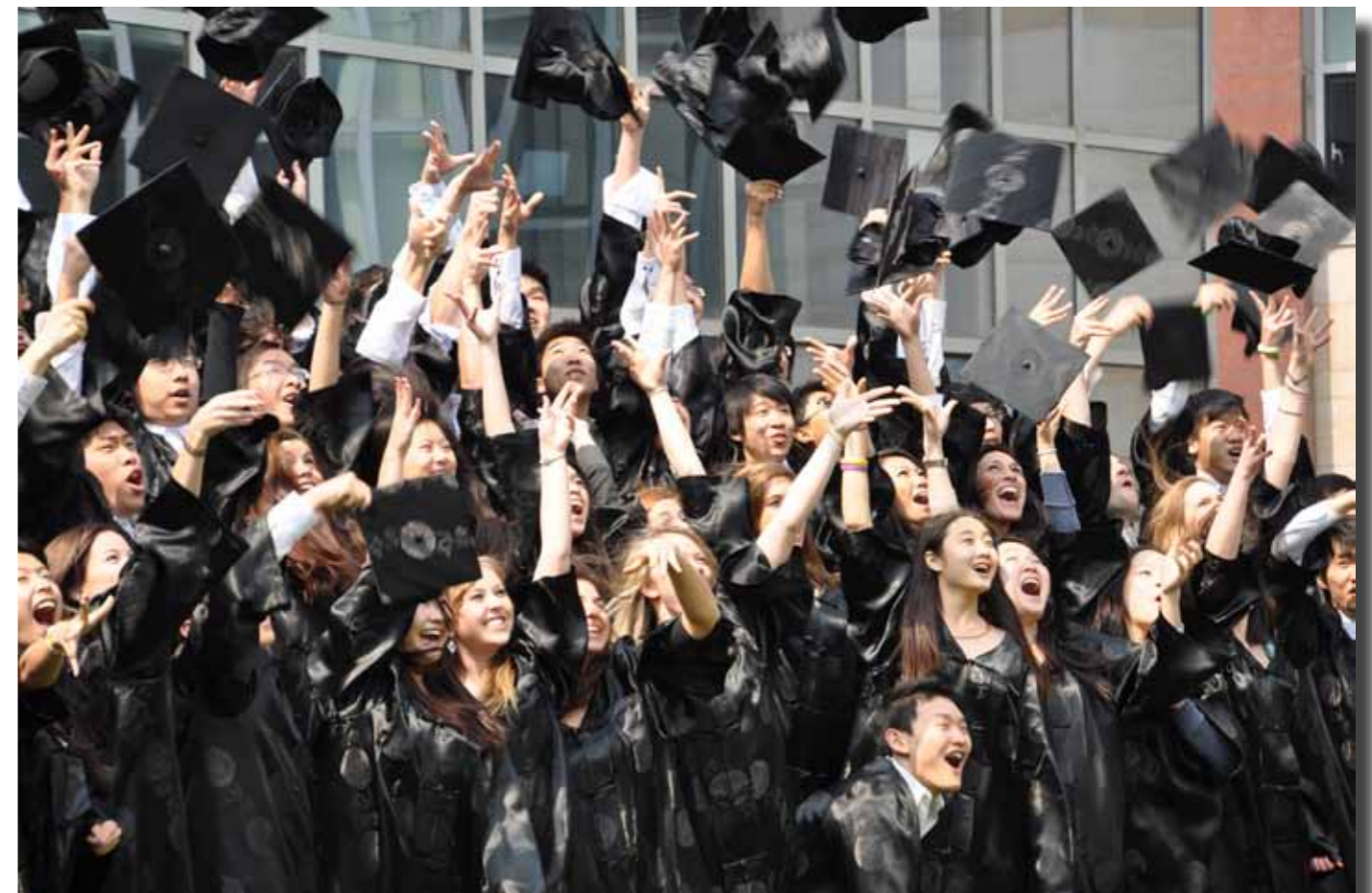
CLASS OF 2011: CAP AND GOWN DAY: Students at Shanghai American School posed for cameras on a recent "Cap and Gown Day," part of the pre-graduation rehearsals and ritual through which every senior passes. This year SAS will graduate 284 seniors (Puxi campus, 167; Pudong Campus, 117), only some of whom are seen here.