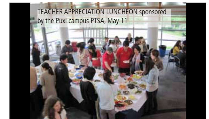
TEACHER APPRECIATION LUNCHEON sponsored by the Puxi campus PTSA, May 11