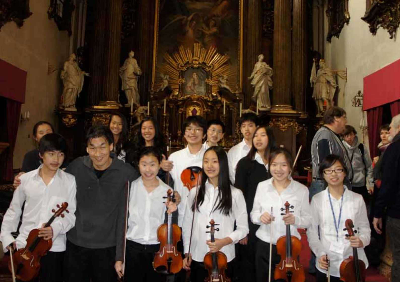
Select students invited to play at Junior Honors Orchestra Festival