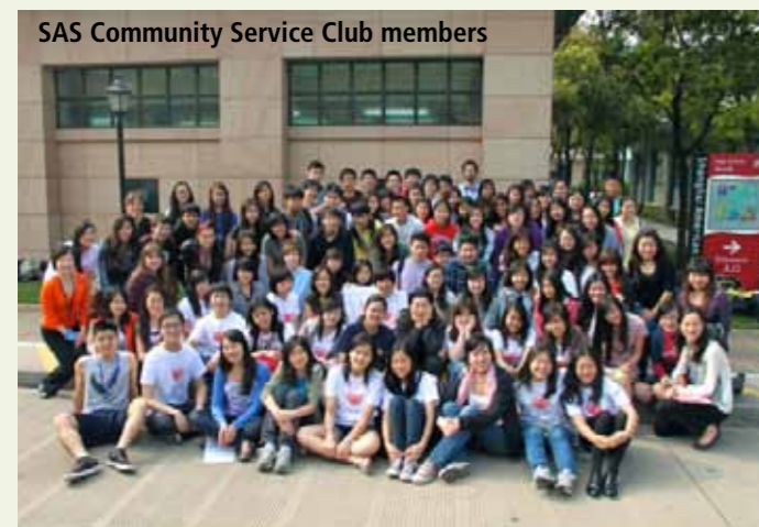
SAS Community Service Club members

Here is a brief summary of our accomplishments this year: