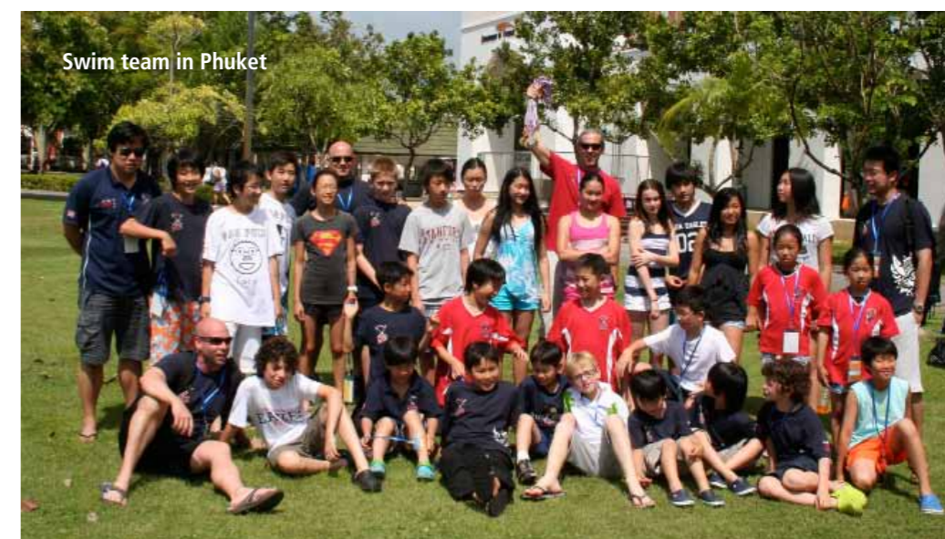
Swim team in Phuket